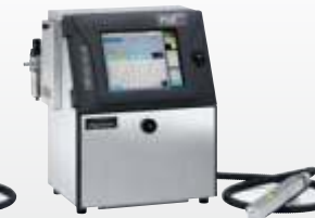
PXR-P 460 W For Pigmented Ink