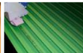
Coding of plastic profile plates