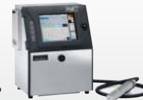
PXR-H 450 W High-Speed Printing