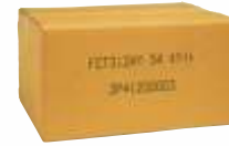
Large Small Characters PXR-D