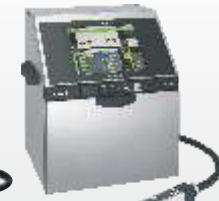
RX-SD 160 W Ink Jet Printer Standard Model