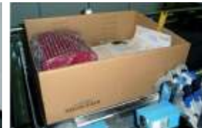
Barcode marking of paperboards