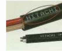
Pigmented Ink PXR-P