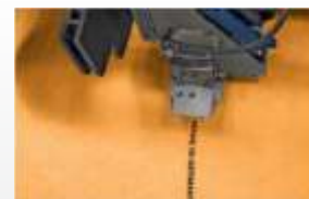
Coding of non-woven fabric