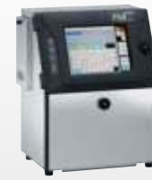
PXR-D 440 W Micro Characters