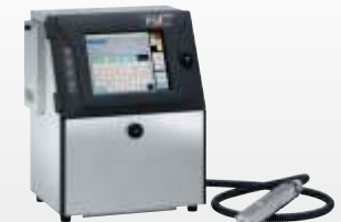
PXR-D 410 W Fast dry and high adhesion inks