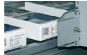
Cardboard Box coding using DataMatrix Code